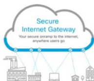
Secure Internet gateways

Make sure you are fully protected by AMP across all components of your network with these additional integrations.