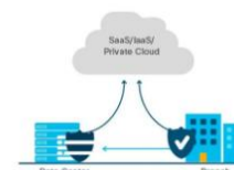
ISR branch router

Breach prevention. Continuous monitoring of malicious behavior. Rapid malware detection. Malware removal.